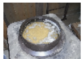
Boiling soybeans to make "Miso" (bean paste) "Miso Making Class" held at Historical Folk house Museum