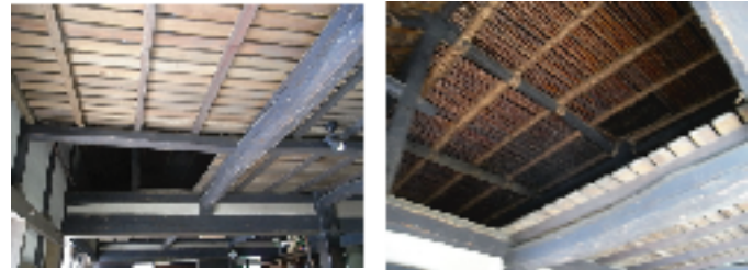
Stairway to the upper floor Cannot be used

A large room was needed to grow more income-earning silkworms, the upper floor was used. The ceiling itself was transformed for sericulture.