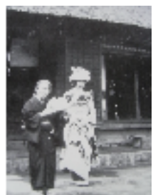
A wedding at Fukami