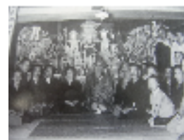
A funeral at ShimoWada

Also, tatami rooms such as "Oku" and "Nando" were used for occasions such as weddings and funerals.