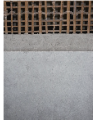
Construction of "Tsuchikabe"

It uses clay mixed with hay which is pasted on to a bamboo reinforcement and another layer of different clay is pasted for protection from rain and water.