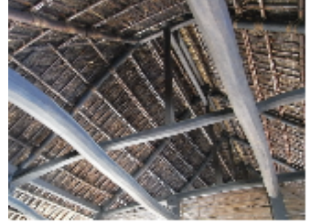
Roof seen from inside of the former Ogawa residence

Looking at the ceiling of the former Ogawa residence, you can see how the roof is built.