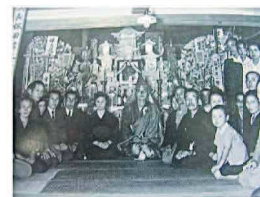
A funeral at ShimoWada

Also, tatami rooms such as "Oku" and "Nando" were used for occasions such as weddings and funerals.