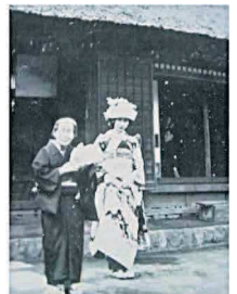
A wedding at Fukami