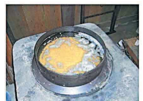
Boiling soybeans to make "Miso" (bean paste)

"Miso Making Class" held at Historical Folk house Museum